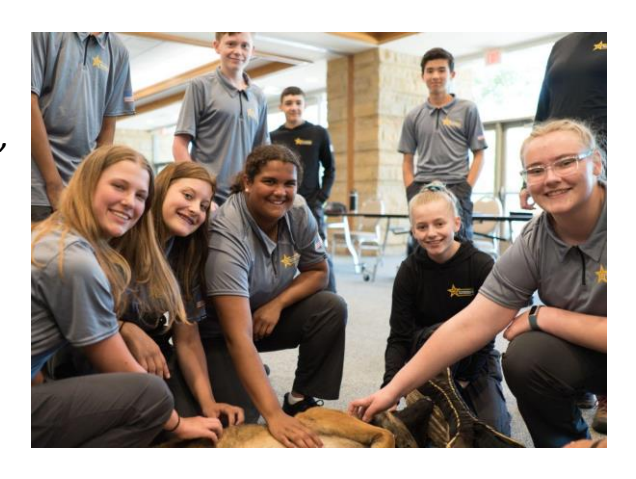
Your sponsorship enables Eagan residents to succeed through our grants and scholarship programs.

"We appreciate the Eagan Community Foundation's responsiveness to the community and their support of organizations that make Eagan a better place through community grants. The Foundation leads the way in building a stronger, healthier community for all of us."